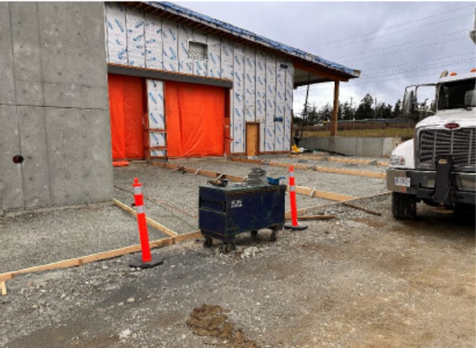
Rear Apron Slab Preparation