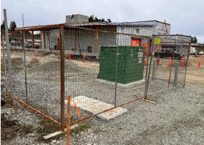
BC Hydro Transformer Installed