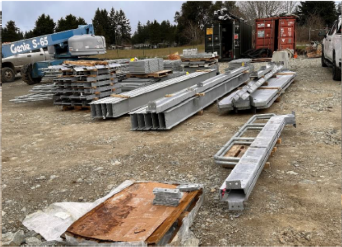
Galvanized Steel for Hose Tower