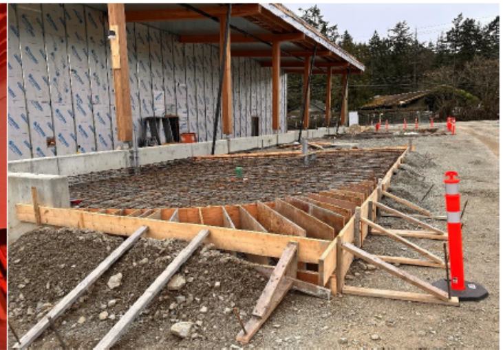
Generator Slab Preparation