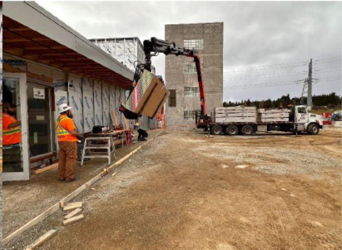
More Drywall Deliveries