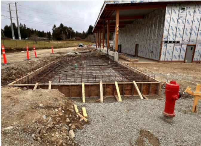
Cistern Tank Slab Preparation