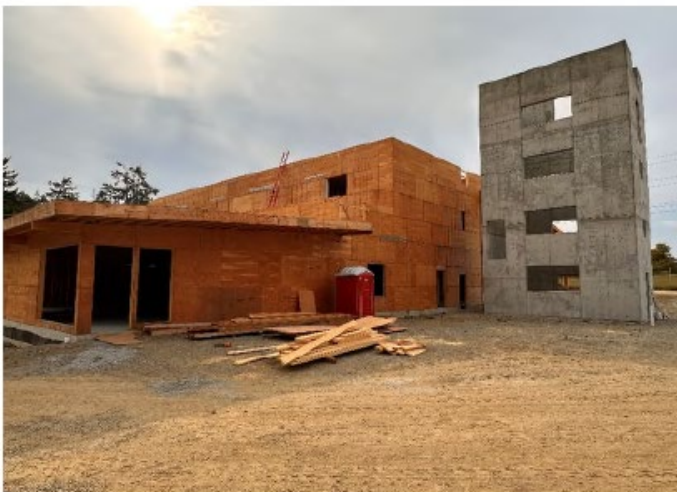
North East View