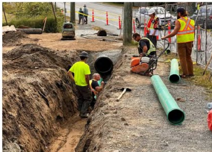
CRD Sewer Extension Connection