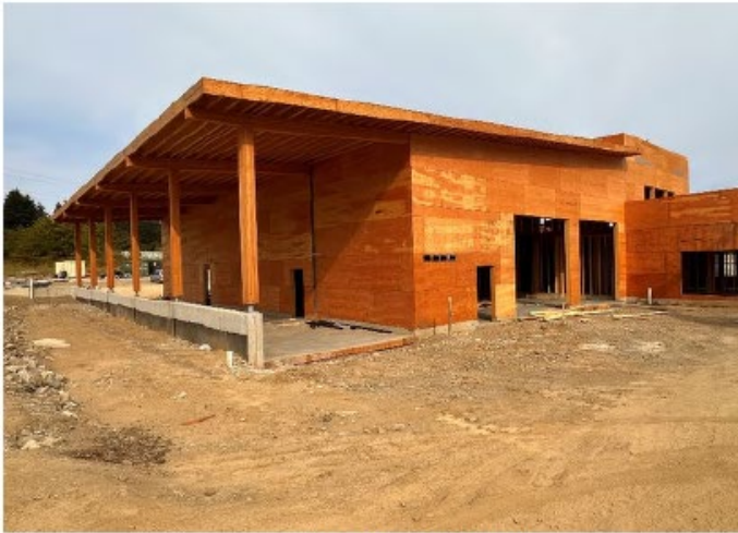
South West View