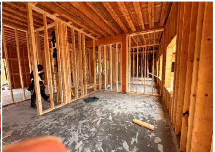
Framing of Interior Walls