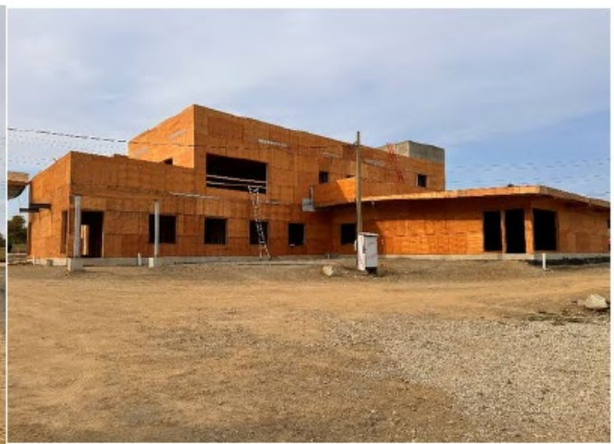
South East View