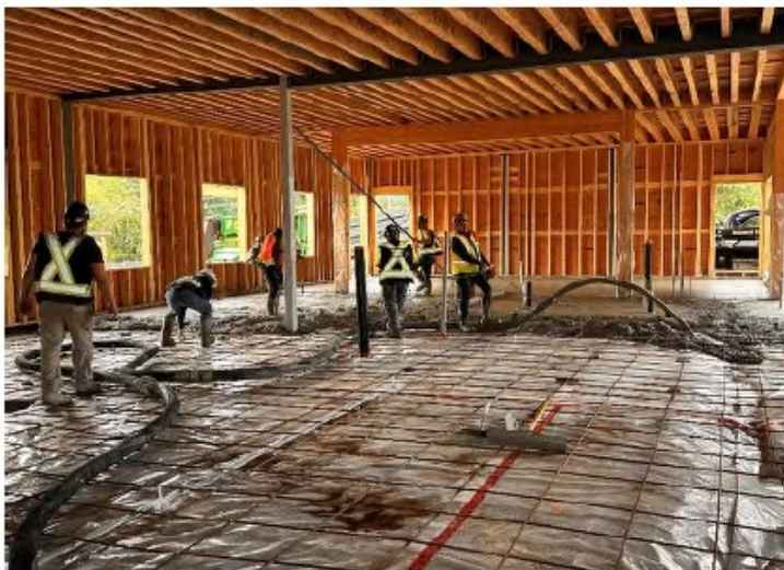
1st of 2 Concrete Pours on Admin. Side