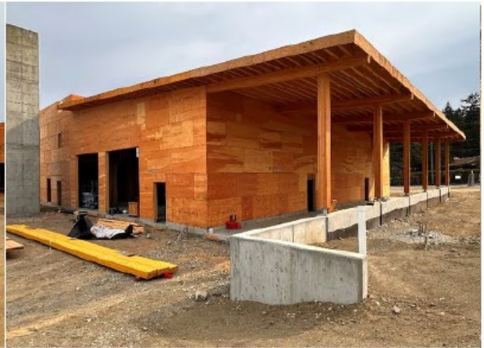
North West View