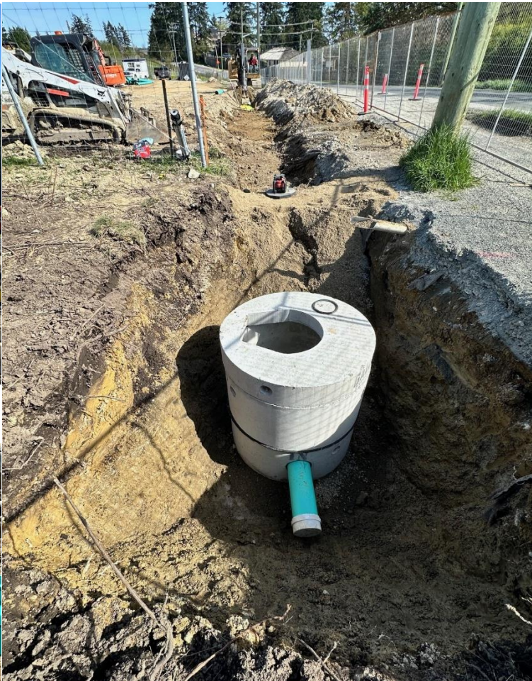
Sewer Line Install