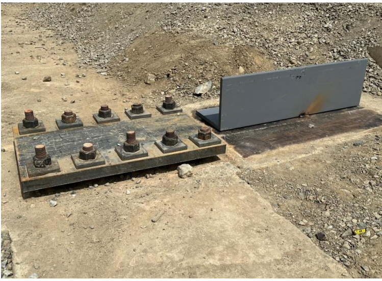
Column Base Plates