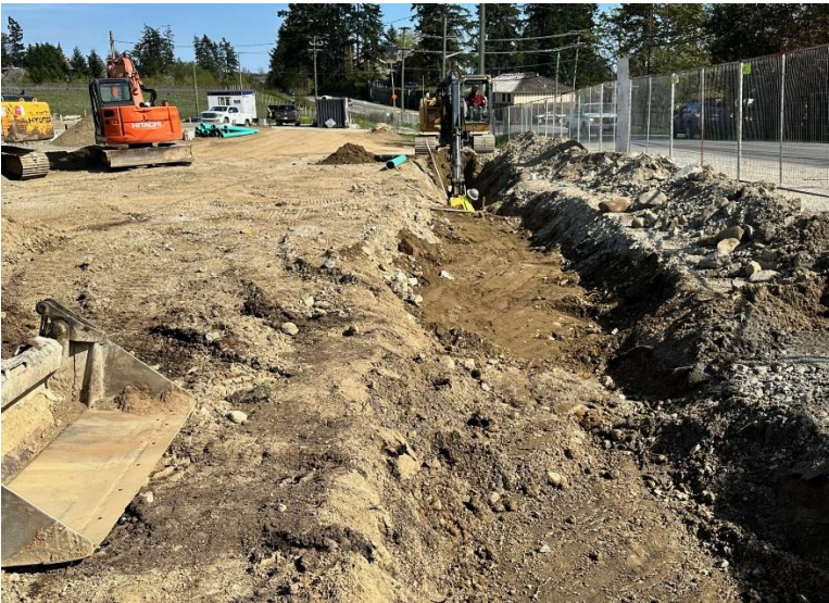
Sewer line install