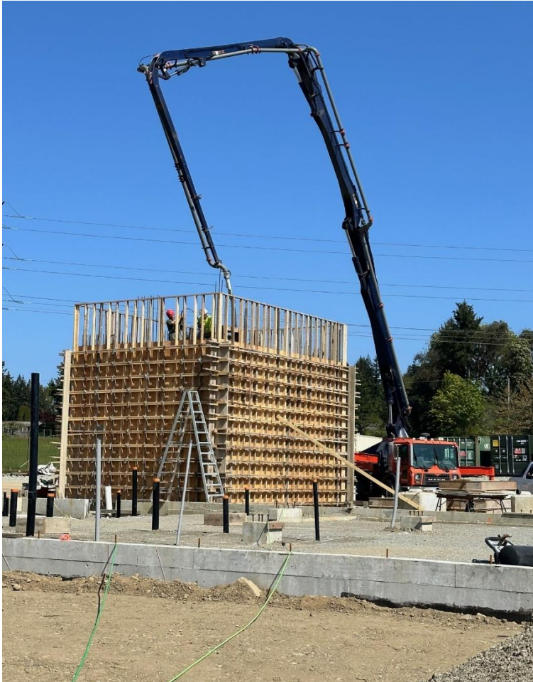
Hose/Training Tower Concrete Pour