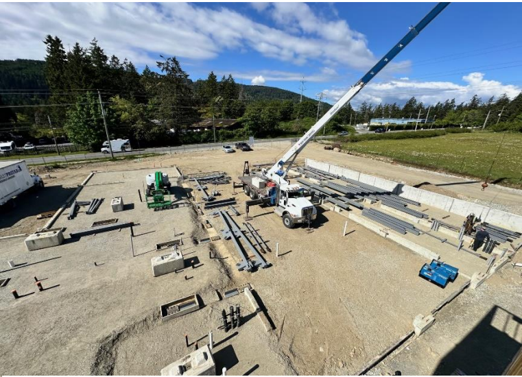
Ariel View 1