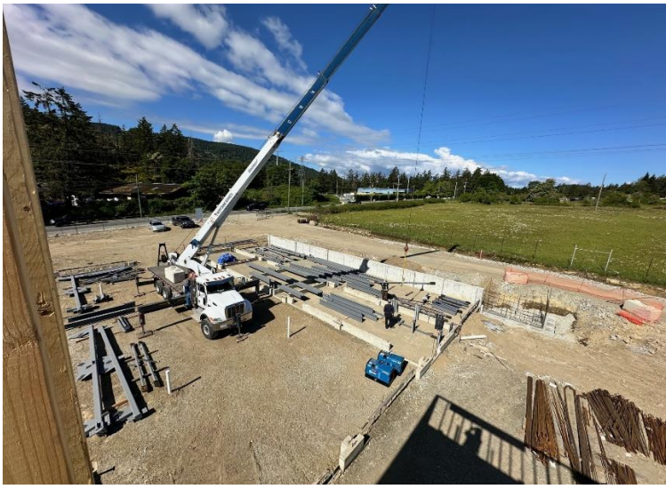
Ariel View 2