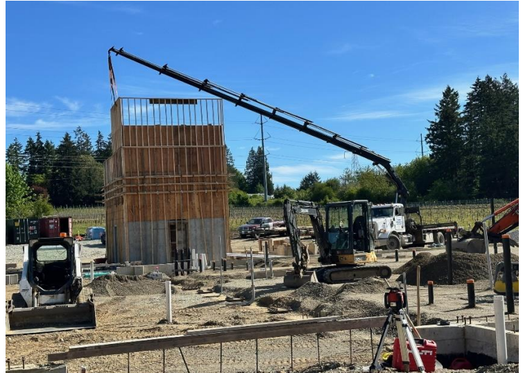
Crane-In Next 16' of Forms