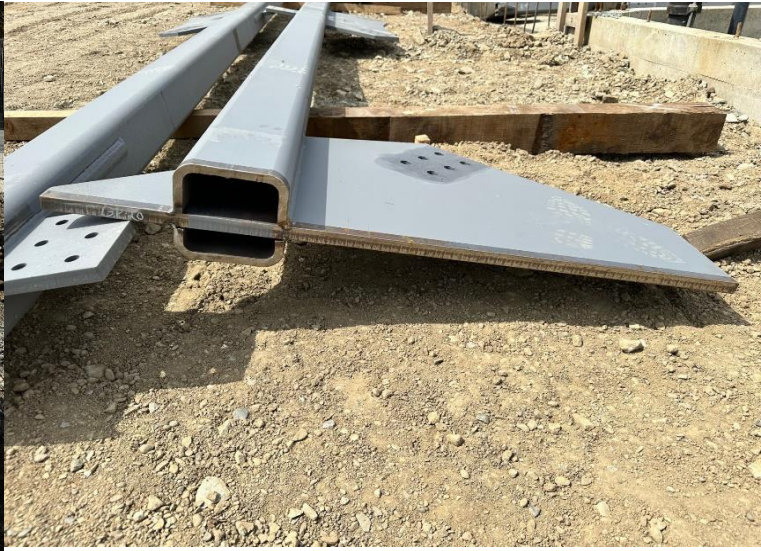
Steel Column with Knife Plates