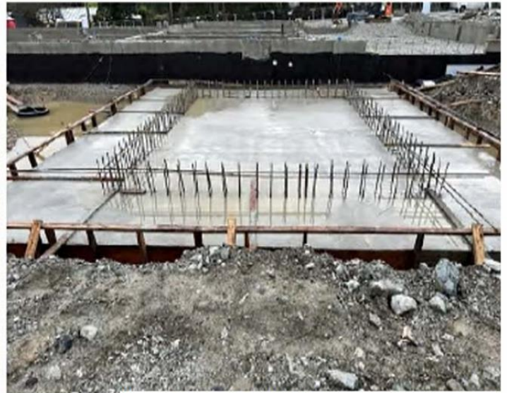
Hose Tower Raft Slab