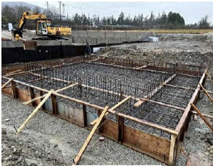
Hose Tower Raft Slab