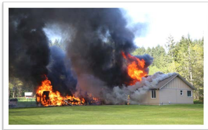
Residential Structure Fire

On April 23 rd SSIFR responded to a fully involved structure fire on Blackburn Road. The extensive fire also included several vehicles, and a motor home. Firefighters shuttled water from Cranberry Road to the fire. No firefighter or civilian injuries were reported, but unfortunately the families pet dog perished in the fire. The fire investigation was managed by RCMP and the cause has yet to be determined. Our thoughts go out to the family as they deal with a significant loss.