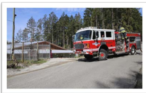
Commercial Structure Fire